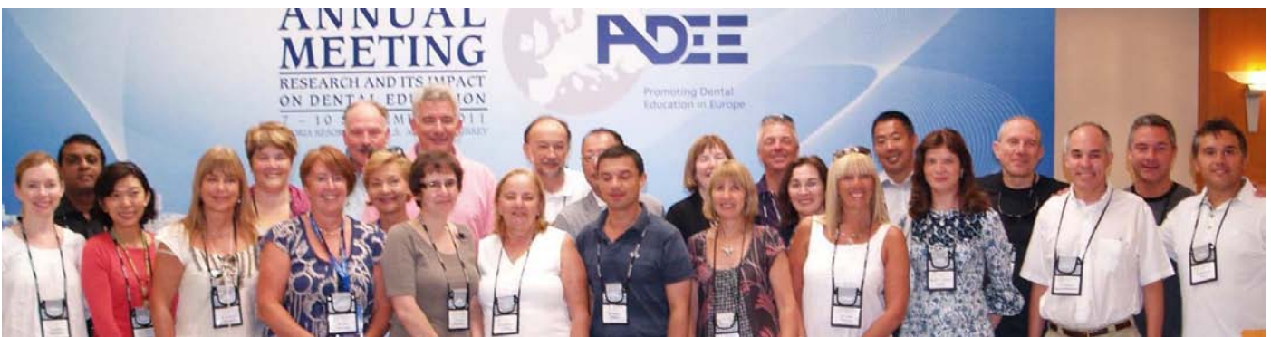
A group of delegates who attended the SCiPE Meeting in Antalya, Turkey September 2011

The iADH Education Committee would like to take this opportunity to thank their sponsors DIACO and ADEE also most importantly to thank ADEE; their very much appreciated support and assistance in facilitating this workshop.