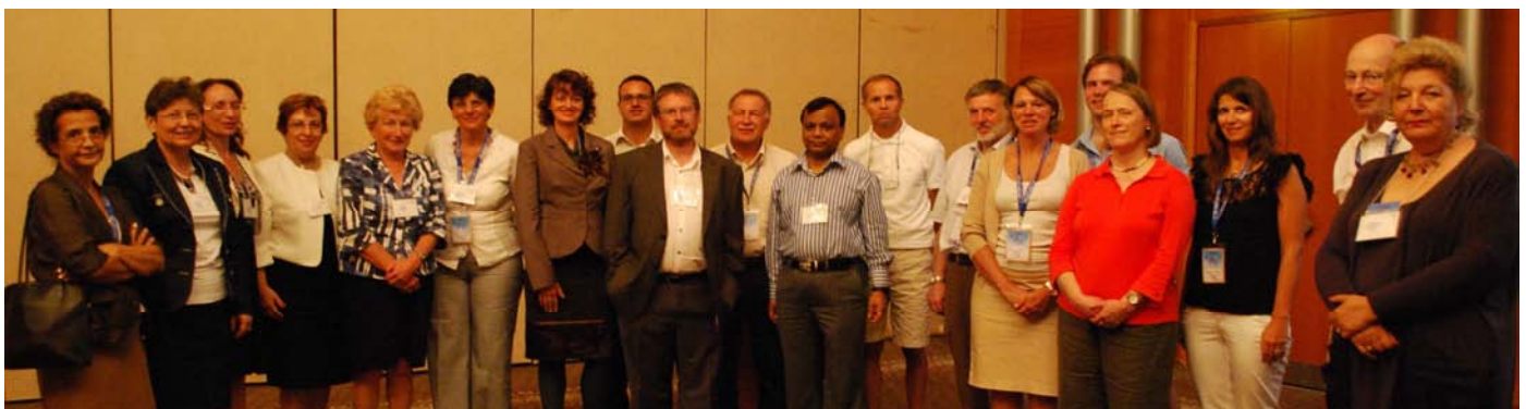
A group of delegates who attended the ABSTD Meeting in Antalya, Turkey September 2011

The meeting concluded with a general discussion on the impact of research in the biomedical and basic sciences on the future of dentistry, how equip our graduates for these changes and how to achieve this within the dental curriculum. Suggestions as to how ADEE may be able to progress this were also considered. (A report on the ABSTD meeting will appear shortly in the European Journal of Dental Education).