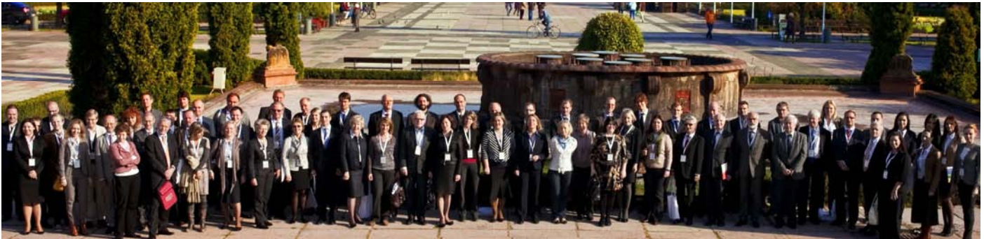
Delegates attending the EU Conference on the Modernisation of Higher Education held in Sopot, Poland