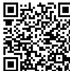
Figure 3 QR code for google maps location of Boat Departure

The departure point is a comfortable 10 minute walk from the meeting venue. Scanning the following QR code will take you to the google maps for this departure location.